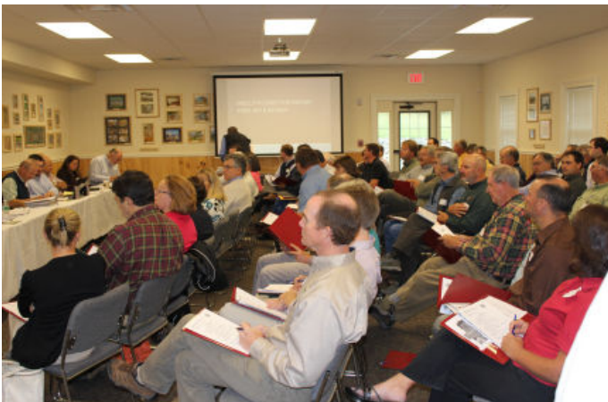
(Members participating in the 2010 members business meeting)