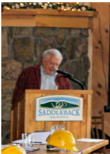
Commissioner Bill Beardsley

threat to the forest industry by a recent 9 th circuit court ruling that would require new highly restrictive EPA permitting of private forest logging roads. Members were educated on the difference between point and non-point sources of pollution as designated by the Clean Water Act. Efforts being taken by a national coalition of industry associations, including congressional legislation and a Supreme Court challenge, were presented and members voiced support to aid in achieving a practical solution.