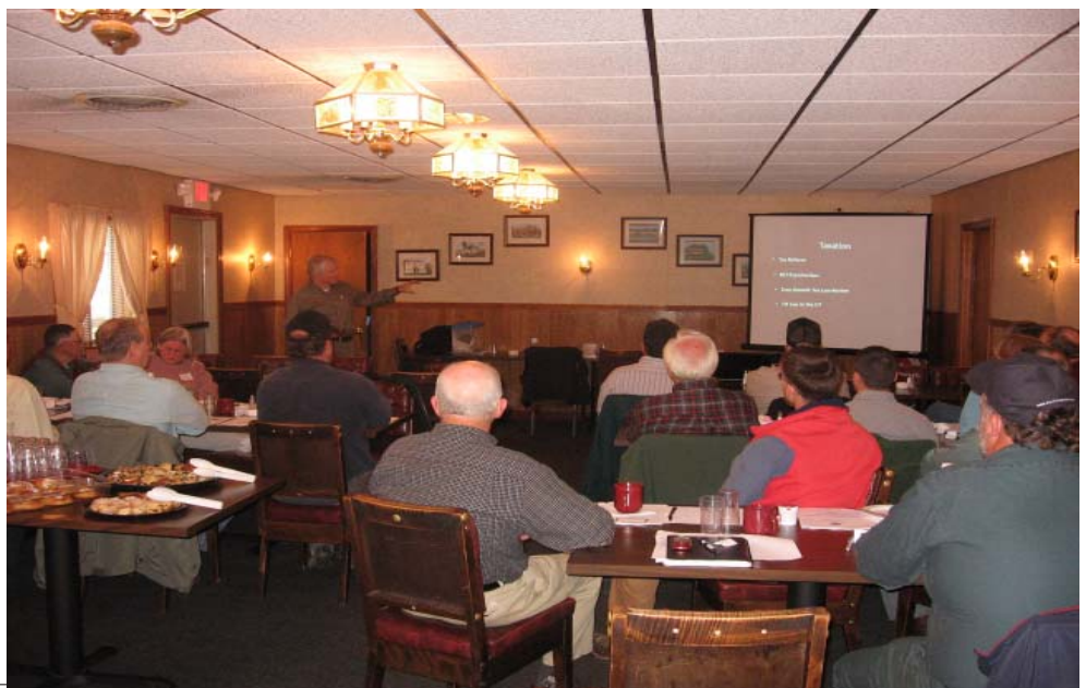
Picture right Machias Breakfast