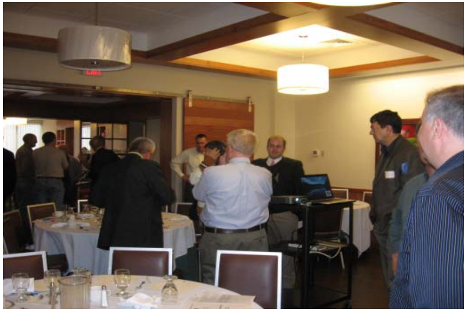
Picture above Bangor Breakfast

Lastly, on behalf of the MFPC we would like to wish all of our members a Happy Thanksgiving and beginning to the holiday season.