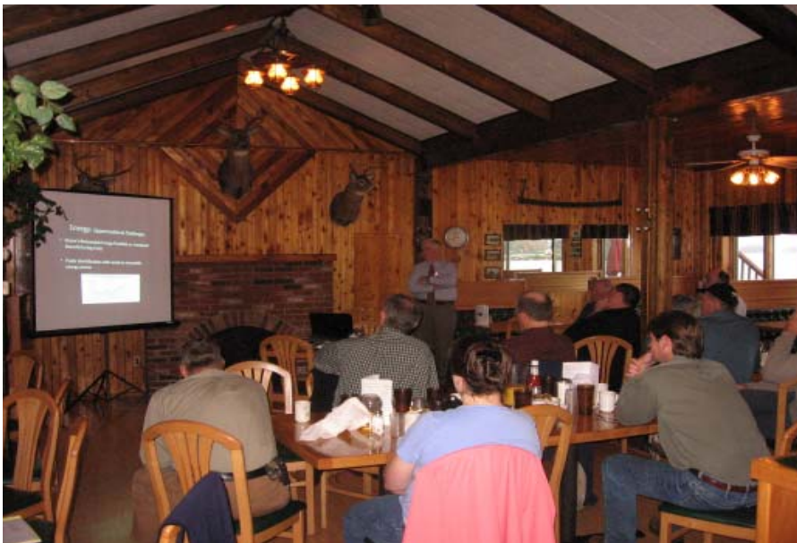
Picture left Greenville Breakfast