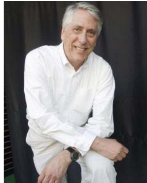
Les Otten, President of Maine Energy Systems and member of the Maine Forest Products Council has recently announced the establishment of an exploratory committee as he mulls a race for governor.

MFPC does plan to keep members updated about the progress of the race for governor in 2010.